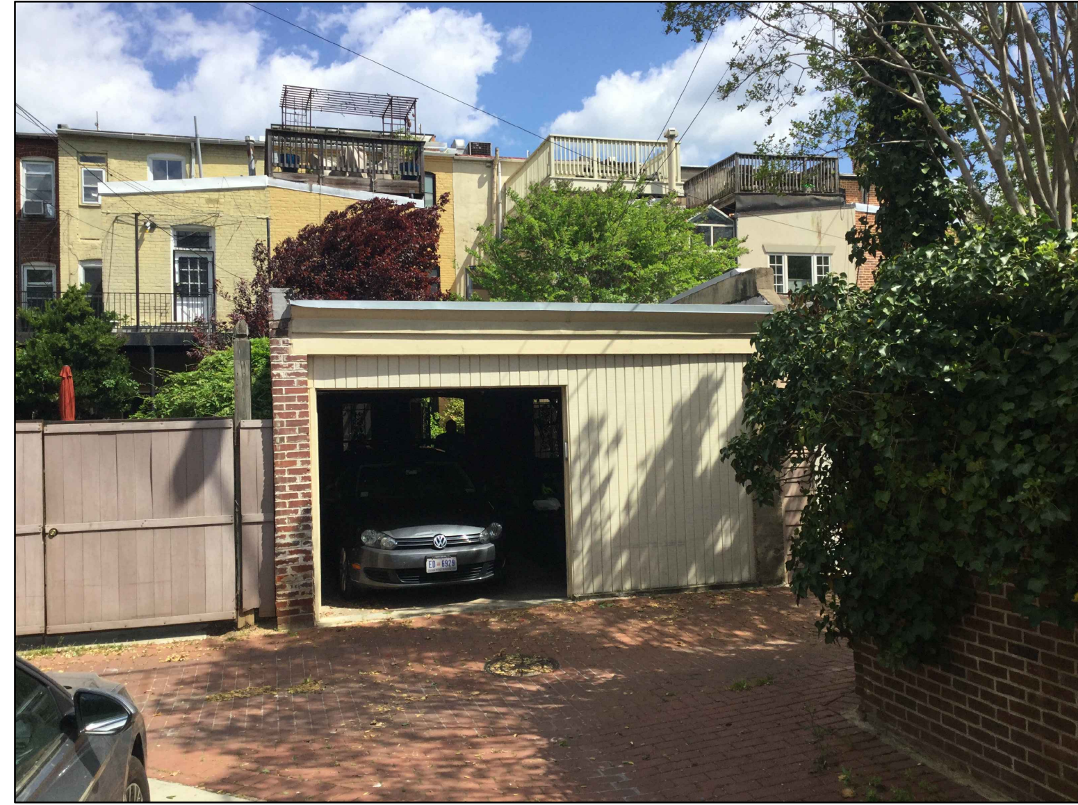
1 VIEW LOOKING NORTH FROM ALLEY NTS