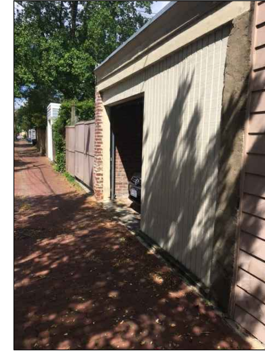
3 VIEW LOOKING NORTHWEST FROM ALLEY NTS