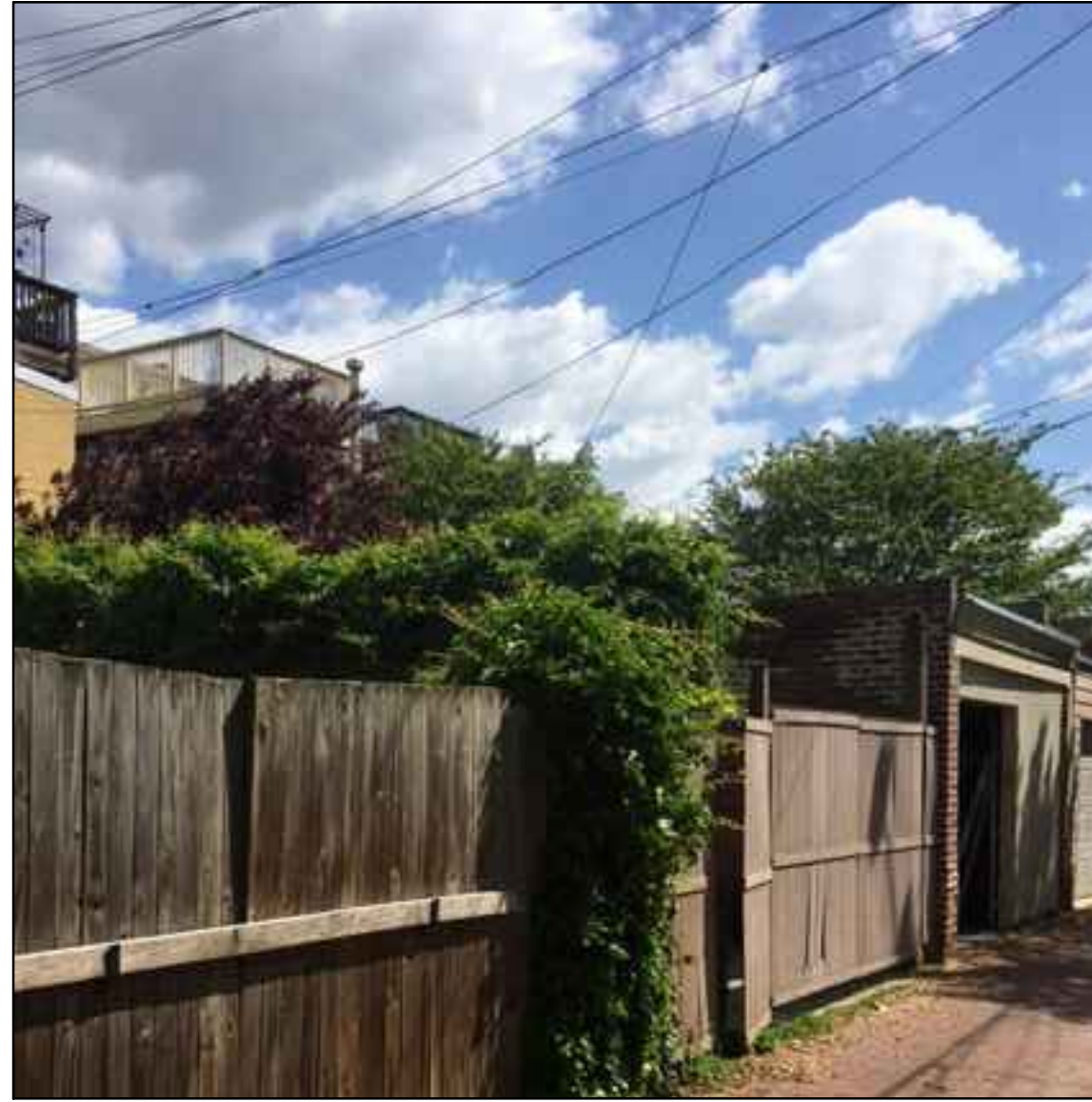
2 VIEW LOOKING NORTHEAST FROM ALLEY NTS