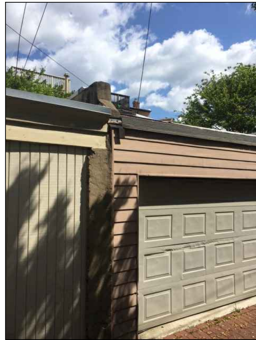
4 VIEW LOOKING NORTH AT EAST PARAPET NTS